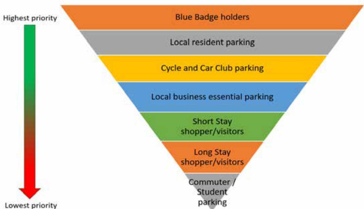
Figure 1 - Parking Hierarchy